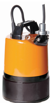
LSC1.4S 25mm outlet