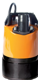
LSC1.4S 50mm outlet